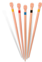
Conform Fit™ gutta-percha points for Protaper Gold®