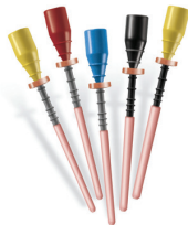
Thermafil® for ProTaper Gold®

INL / B EN PTGO TIP 000 / 03 / 2017 - updated 11 / 2017